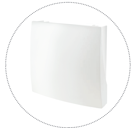
Q gateway 5 battery-operated or with power supply available

Its wide functional range makes Q gateway 5 the ideal solution for all applications and projects which require full energy autonomy at the location where the gateway is used. In combination with the functions of the Q SMP, Q gateway 5 makes a major contribution to significant savings of time, work and expense .